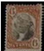
OFFER #17823 #R138, PINHOLE OUR PRICE $30-