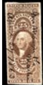
OFFER #17786 #R47a OUR PRICE $30-