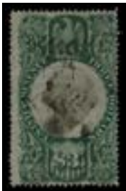
OFFER #17830 #R147, CUT CANCEL OUR PRICE $20-