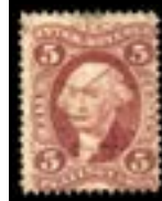
OFFER #17783 #R26 OUR PRICE $30-