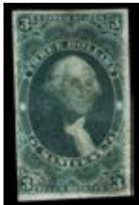
OFFER #17806 #R86a OUR PRICE $150-