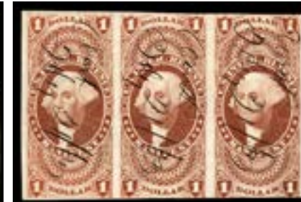
OFFER #17796 #R72a, STRIP IF 3 OUR PRICE $215-