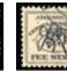
OFFER #17851 #RK20 OUR PRICE $15-