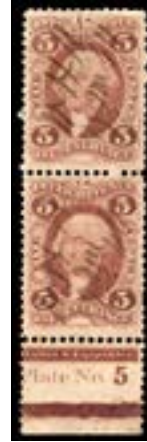
OFFER #17782 #R27c, PLATE PIECE OUR PRICE $25-