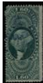
OFFER #17802 #R79, FOLD OUR PRICE $60-