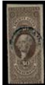
OFFER #17789 #R52a OUR PRICE $50-