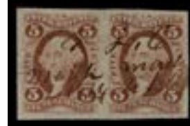
OFFER #17781 #R27a, PAIR OUR PRICE $35-