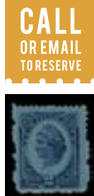
OFFER #17832 #R152c OUR PRICE $20-