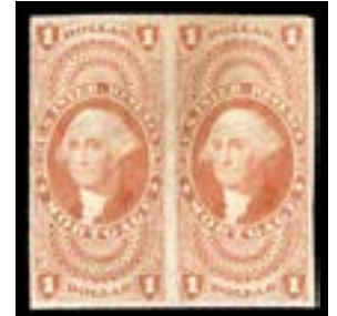
OFFER #17797 #R73a, PAIR OUR PRICE $60-