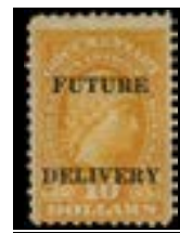
OFFER #17848 #RD114 OUR PRICE $150-