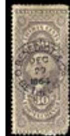
OFFER #17788 #R51c OUR PRICE $50-