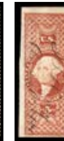
OFFER #17810 #R91a OUR PRICE $135-