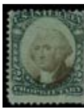
OFFER #17840 #RB19b OUR PRICE $22-