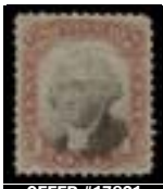
OFFER #17821 #R134, CUT CANCEL VIGNETTE SHIFT DOWN WELL CENTERED OUR PRICE $30-