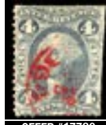
OFFER #17780 #R21c, FAULTS SPACE FILLER OUR PRICE $125-