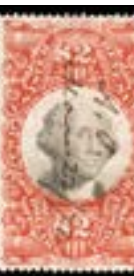
OFFER #17828 #R145 OUR PRICE $30-