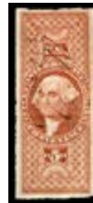
OFFER #17808 #R89a OUR PRICE $35-