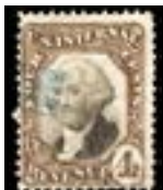
OFFER #17822 #R136, HAND STAMP CANCEL CUT OUR PRICE $70-