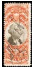
OFFER #17824 #R140 OUR PRICE $27.50