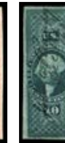
OFFER #17811 #R94a OUR PRICE $105-