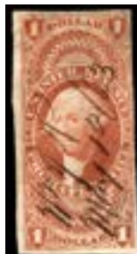
OFFER #17799 #R76a OUR PRICE $60-