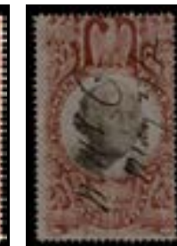
OFFER #17829 #R146 OUR PRICE $40-