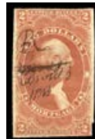
OFFER #17803 #R82a OUR PRICE $40-