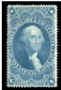
OFFER #17807 #R87c OUR PRICE $80-