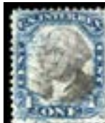
OFFER #17815 #R103, CUT CANCEL OUR PRICE $30-

VISIT TODAY & OFTEN NEW ITEMS UPLOADED EVERY WEEK