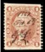
OFFER #17777 #R1b OUR PRICE $35-