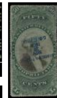
OFFER #17843 #R88b, SM FAULTS OUR PRICE $350-