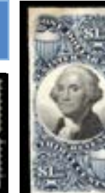
OFFER #17818 #R118/P3, PROOF OUR PRICE $40-