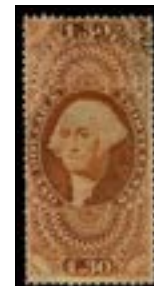
OFFER #17800 #R77c OUR PRICE $85-