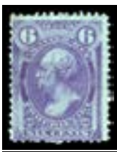
OFFER #17846 #RC26, LH OUR PRICE $25-