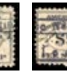
OFFER #17852 #RK26 OUR PRICE $350-