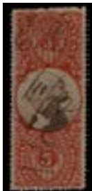
OFFER #17831 #R148 OUR PRICE $25-