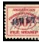
OFFER #17850 #RK9 OUR PRICE $105-