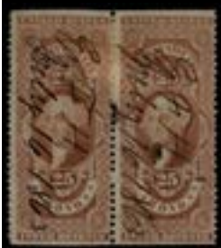
OFFER #17784 #R43b, PAIR OUR PRICE $50-