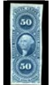
OFFER #17790 #R58a OUR PRICE $50-