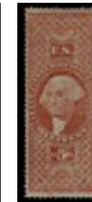
OFFER #17809 #R90c OUR PRICE $125-