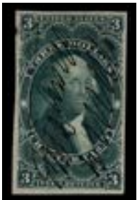
OFFER #17805 #R65a OUR PRICE $150-