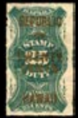
OFFER #17778 HAWAII #R8, NO GUM OUR PRICE $65-