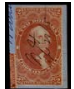
OFFER #17804 #R83c OUR PRICE $45-