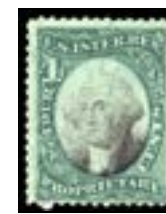
OFFER #17841 #RB4b OUR PRICE $50-