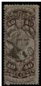
OFFER #17825 #R141 OUR PRICE $23-