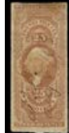
OFFER #17787 #R49a OUR PRICE $25-