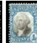
OFFER #17816 #R106 OUR PRICE $50-