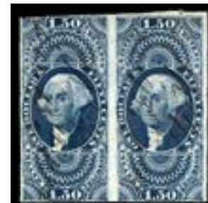
OFFER #17801 #R78a, PAIR OUR PRICE $35-