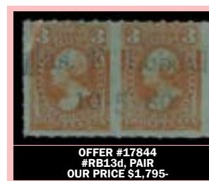
OFFER #17844 #RB13d, PAIR OUR PRICE $1,795-