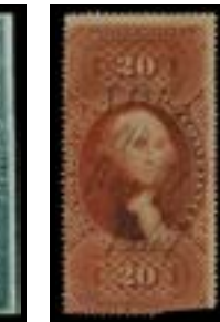
OFFER #17812 #R98c OUR PRICE $25-