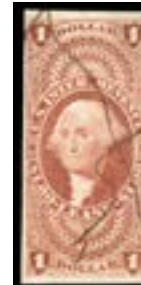
OFFER #17795 #R70a OUR PRICE $30-