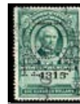
OFFER #17849 #RD114 OUR PRICE $30-