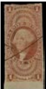
OFFER #17798 #R74a, FAULTS OUR PRICE $150-

INTEREST FREE INSTALLMENT TERMS AVAILABLE IF NEEDED FOR LARGER PURCHASES!