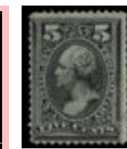
OFFER #17845 #RB16a OUR PRICE $150-