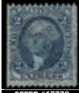
OFFER #17779 #R9b IMPERF VERTICALLY OUR PRICE $35-