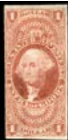
OFFER #17793 #R67a OUR PRICE $30-