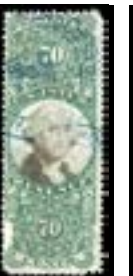
OFFER #17827 #R143 OUR PRICE $65-