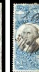
OFFER #17819 #R119 OUR PRICE $75-