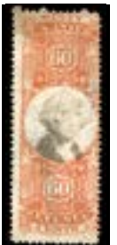
OFFER #17826 #R142 OUR PRICE $25-