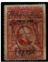
OFFER #17839 #R692 OUR PRICE $25-