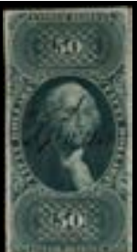
OFFER #17814 #R101a OUR PRICE $185-

VISIT TODAY & OFTEN NEW ITEMS UPLOADED EVERY WEEK