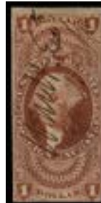
OFFER #17794 #R68a OUR PRICE $65-