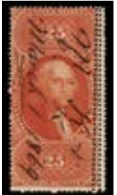
OFFER #17813 #R100c EXTRA PERFS AT RT OUR PRICE $65-