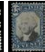
OFFER #17817 #R110, CUT CANCEL EXTRA PERFS AT RT OUR PRICE $25-