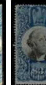
OFFER #17820 #R125, CUT CANCEL OUR PRICE $25-