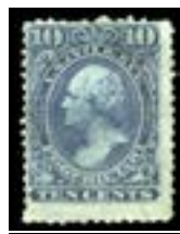
OFFER #17847 #RD114 OUR PRICE $225-