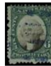
OFFER #17842 #RB6 OUR PRICE $50-