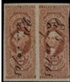
OFFER #17785 #R45a, PAIR OUR PRICE $30-