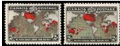
OFFER #17382 CANADA #85-86, MINT NH OUR PRICE $120-