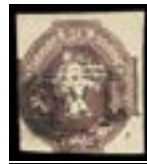
OFFER #17396 GB #7, USED ALMOST 4MGN OUR PRICE $500-