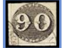
OFFER #17379 BRAZIL #3, USED 4MGN JUST CLEAR AT UL OUR PRICE $780-