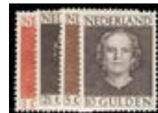
OFFER #17403 NETHERLANDS #319-322, MINT LH OUR PRICE $210-