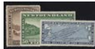
OFFER #17404 NEWFOUNDLAND #C6-8, COMPLETE SET V, MINT LH OUR PRICE $67.50