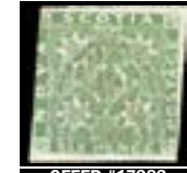
OFFER #17383 CANADA NOVA SCOTIA #5, USED SW THIN NICE APPEARANCE OUR PRICE $375-