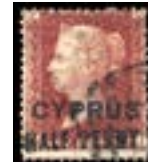
OFFER #17387 CYPRUS #9 PLATE 216, USED OUR PRICE $125-