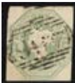
OFFER #17395 GB #5, USED OUR PRICE $295-