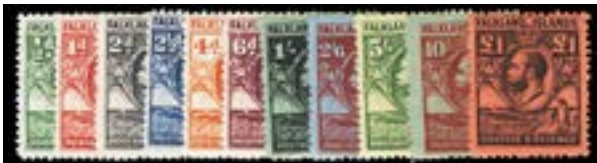
OFFER #17391 FALKLAND #54-64, MINT LH OUR PRICE $508.40