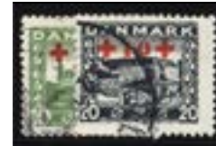
OFFER #17389 DENMARK #B1-2, USED OUR PRICE $82.20