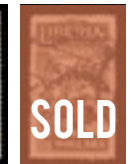
OFFER #17401 LIBERIA #B15, USED OUR PRICE $120-