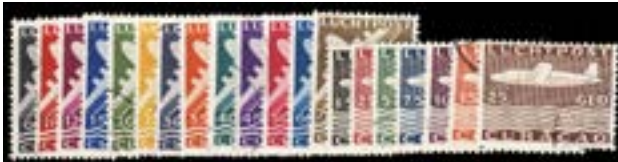
OFFER #17386 CURACAO #C32A-50, USED OUR PRICE $203.50