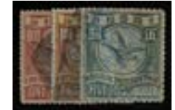
OFFER #17385 CHINA TAIWAN #120-22, USED AS IS OUR PRICE $95-