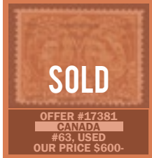
OFFER #17381 CANADA #63, USED OUR PRICE $600-