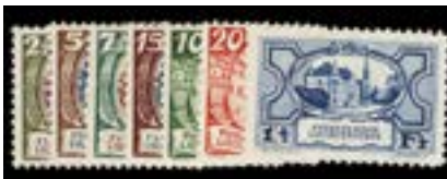
OFFER #17402 LIECHTENSTEIN #74-80, MINT LH OUR PRICE $93.30