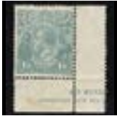
OFFER #17374 AUSTRALIA #76a (PERF 14), MINT NH HINGED IN SELVAGE OUR PRICE $165-