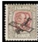
OFFER #17398 ICELAND #C2, MINT NH OUR PRICE $120-