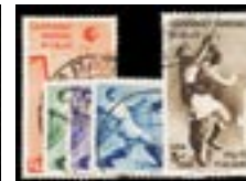
OFFER #17400 ITALY #324-28, USED OUR PRICE $436.60