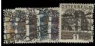
OFFER #17375 AUSTRIA #B87-92, USED PHILATELIC CANCELS OUR PRICE $99-