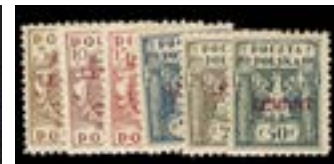
OFFER #17405 POLAND #2K1, 2K3-6, MINT LH OUR PRICE $216-