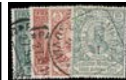
OFFER #17399 ITALY #115-118, USED OUR PRICE $228-