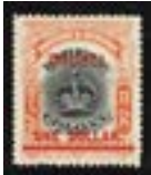
OFFER #17380 BRUNEI #12, MINT LH OUR PRICE $75-