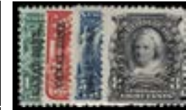
OFFER #17384 CANAL ZONE #4-7, MINT LH OUR PRICE $183-