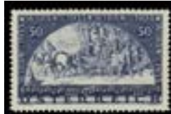
OFFER #17376 AUSTRIA #B110, MINT LH OUR PRICE $90-