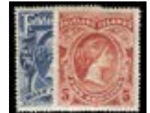
OFFER #17390 FALKLAND #20-21, MINT LH OUR PRICE $330-