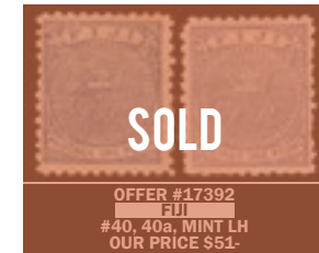
OFFER #17392 FIJI #40, 40a, MINT LH OUR PRICE $51-