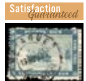
OFFER #17406 PUERTO RICO #133, USED OUR PRICE $60-