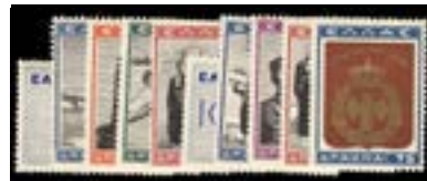
OFFER #17397 GREECE #427-36, MINT LH OUR PRICE $137.90