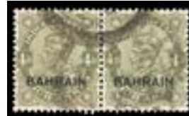
OFFER #17377 BAHRAIN #9, USED PAIR OUR PRICE $105-