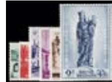
OFFER #17378 BELGIUM #B581-6, MINT NH OUR PRICE $105-