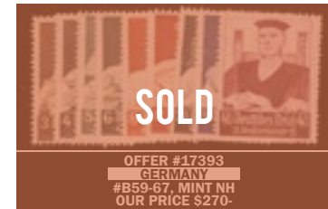
OFFER #17393 GERMANY #B59-67, MINT NH OUR PRICE $270-