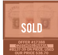
OFFER #17388 CZECHOSLOVAKIA #B137-39 ON PIECE, USED OUR PRICE $38.70