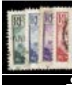
OFFER #17101 POLAND #1K11A, MINT NH OUR PRICE $72-