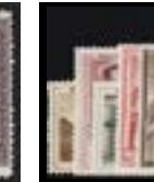
OFFER #17075 BELGIUM #B2413, MINT NH OUR PRICE $84-