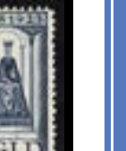
OFFER #17103 SPAIN #C97 SIGNED ROIG, MINT LH OUR PRICE $135-