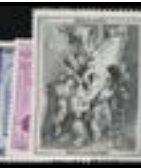
OFFER #17076 BRAZIL #2, 4MIGNS, USED OUR PRICE $165-