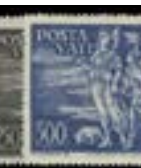
OFFER #17105 ZANZIBAR #134 PAIR, MINT LH OUR PRICE $345-