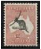
OFFER #17072 AUSTRALIA #129, USED SMALL RUB AT TL OUR PRICE $480-