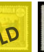
OFFER #17104 VATICAN #C16 MINT LH, #C17 MINT NH OUR PRICE $384-