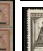
OFFER #17101 POLAND #1K11A, MINT NH OUR PRICE $72-