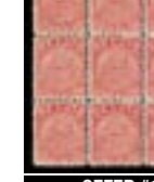
OFFER #17099 NETHERLANDS #134, MINT NH OUR PRICE $216-