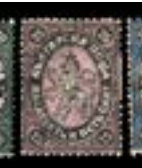
OFFER #17079 CANADA #60, F/VF, MINT LH OUR PRICE $190-