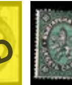
OFFER #17078 CANADA #65, USED OUR PRICE $600-