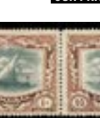
OFFER #17100 NEW SOUTH WALES #74, USED OUR PRICE $40-