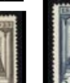
OFFER #17102 POLAND #1K12A, MINT NH OUR PRICE $84-