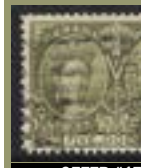
OFFER #17081 CAPE OF GOOD HOPE #6a, USED OUR PRICE $225-