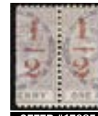
OFFER #17095 LAOS - PATHET LAO #1-8 MICHEL, 2 CPLT SETS, MINT NH OUR PRICE $45-