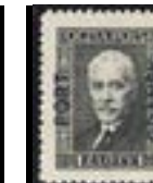
OFFER #17102 POLAND #1K12A, MINT NH OUR PRICE $84-