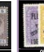
OFFER #17093 ISRAEL #33-34 TABS, MINT NH OUR PRICE $350-