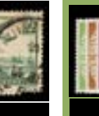
OFFER #17103 SPAIN #C97 SIGNED ROIG, MINT LH OUR PRICE $135-