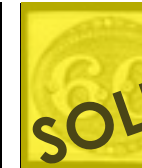
OFFER #17077 BULGARIA #2-4, USED OUR PRICE $95-