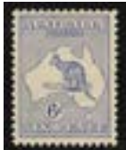
OFFER #17071 AUSTRALIA #40, MINT VLH OUR PRICE $102-