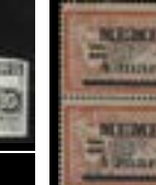
OFFER #17100 NEW SOUTH WALES #74, USED OUR PRICE $40-