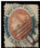
OFFER #17100 NEW SOUTH WALES #74, USED OUR PRICE $40-