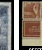
OFFER #17093 ISRAEL #33-34 TABS, MINT NH OUR PRICE $350-