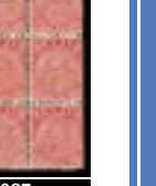
OFFER #17100 NEW SOUTH WALES #74, USED OUR PRICE $40-