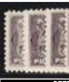
OFFER #17084 CZECHOSLOVAKIA #B3738 MINT NH, #38 ONE PULLED PERF AT RIGHT, #B39 MINT XLH W/APS CERT OUR PRICE $600-