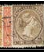
OFFER #17098 NETHERLANDS #133, MINT NH OUR PRICE $270-