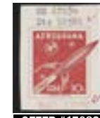
OFFER #17088 FRANCE #C8-14, USED OUR PRICE $225-