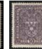
OFFER #17074 AUSTRIA #167, MINT LH OUR PRICE $84-