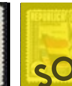
OFFER #17103 SPAIN #C97 SIGNED ROIG, MINT LH OUR PRICE $135-