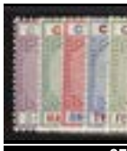
OFFER #17091 GREAT BRITAIN #29 PL #12, MINT LH OUR PRICE $995-