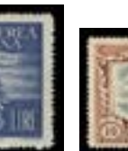
OFFER #17106 ZULULAND #22, MINT LH OUR PRICE $120-