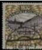
OFFER #17073 AUSTRIA #143, USED OUR PRICE $135-