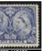
OFFER #17083 CYPRUS #28-37, MINT LH OUR PRICE $242-