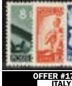
OFFER #17094 ITALY #486-88, MINT XLH OUR PRICE $107-