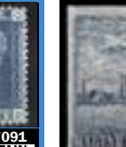
OFFER #17099 NETHERLANDS #134, MINT NH OUR PRICE $216-