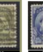
OFFER #17082 CUBA AIRLETTER, DIE OUR PRICE $195-