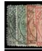
OFFER #17096 LUXEMBURG #B65A-Q, MINT NH OUR PRICE $270-