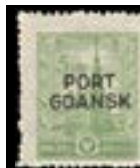
OFFER #17101 POLAND #1K11A, MINT NH OUR PRICE $72-