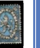
OFFER #17080 CANADA #J1-5, MINT NH OUR PRICE $255-