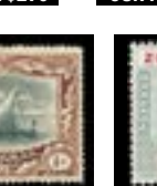
OFFER #17101 POLAND #1K11A, MINT NH OUR PRICE $72-