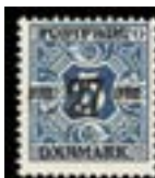
OFFER #18291 DENMARK #139, MINT LH OUR PRICE $63-