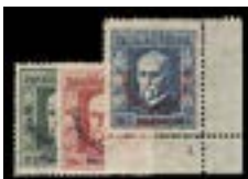
OFFER #18290 CZECHOSLOVAKIA #B137-39, 2V. SIGNED MINT NH OUR PRICE $72-