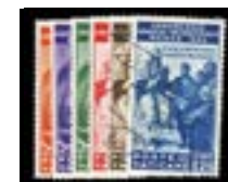
OFFER #18307 VATICAN #41-46, USED OUR PRICE $92-