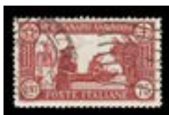
OFFER #18298 ITALY #263a PERF 12, USED OUR PRICE $225-