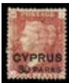
OFFER #18289 CYPRUS #7 PLATE 217 NO GUM OUR PRICE $100-