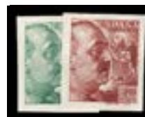
OFFER #18306 SPAIN #681-682 IMPERF, MINT NH OUR PRICE $120-