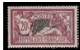
OFFER #18293 FRANCE #132, MINT LH OUR PRICE $120-