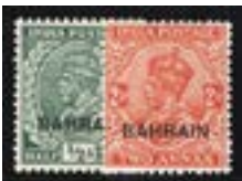
OFFER #18280 BAHRAIN #18-19, MINT LH OUR PRICE $56-