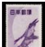
OFFER #18299 JAPAN #479, MINT LH OUR PRICE $45-