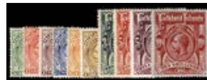
OFFER #18292 FALKLAND #30-39, MINT LH OUR PRICE $663-