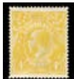
OFFER #18278 AUSTRALIA #31a, MINT LH OUR PRICE $75-