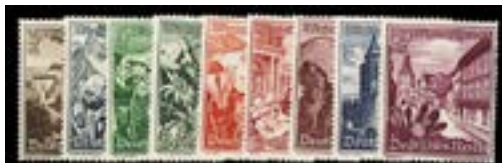
OFFER #18294 GERMANY BERLIN #B123-131, MINT NH OUR PRICE $45-