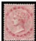
OFFER #18288 CEYLON #71, MINT LH OUR PRICE $83-