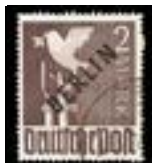
OFFER #18295 GERMANY BERLIN #9N18, USED OUR PRICE $195-