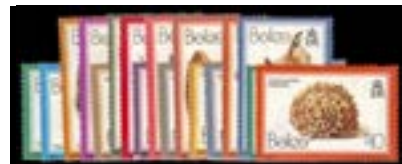
OFFER #18282 BELIZE #471-87, MINT NH OUR PRICE $60-