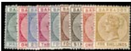
OFFER #18281 BARBADOS #60-68, MINT LH OUR PRICE $706-