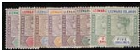
OFFER #18300 LEEWARD IS. #1-8, MINT LH OUR PRICE $171-