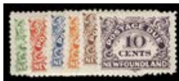
OFFER #18304 NEWFOUNDLAND #J1-6, MINT NH OUR PRICE $55-