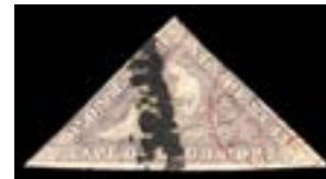
OFFER #18287 CAPE OF GOOD HOPE #5, USED OUR PRICE $225-