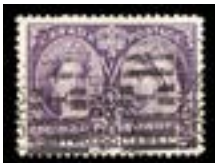
OFFER #18285 CANADA #62, USED OUR PRICE $330-