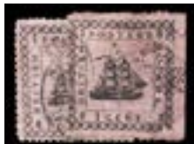
OFFER #18283 BR. GUIANA #103-4, USED OUR PRICE $53-