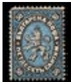
OFFER #18284 BULGARIA #4, NO GUM OUR PRICE $95-