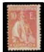
OFFER #18305 PORTUGAL #298T, MINT LH OUR PRICE $105-