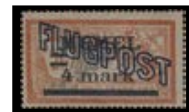
OFFER #18302 LIECHTENSTEIN #C5a TYPE II, MINT NH SMALL GUM DIST. AREA OUR PRICE $120-