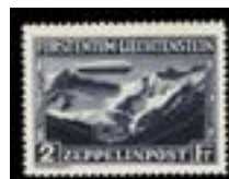
OFFER #18301 LIECHTENSTEIN #C8, MINT LH OUR PRICE $84-