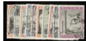
OFFER #18297 GREECE #C38-47, USED OUR PRICE $182-