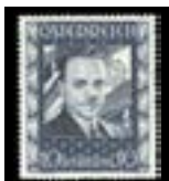
OFFER #18279 AUSTRIA #380, MINT LH OUR PRICE $435-