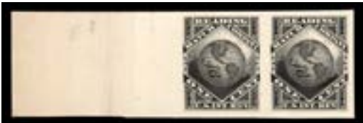
OFFER #18960 #R0152P4, PAIR OUR PRICE $95-