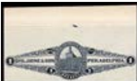
OFFER #18999 #RS144P4 OUR PRICE $65-