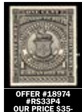
OFFER #18974 #RS33P4 OUR PRICE $35-