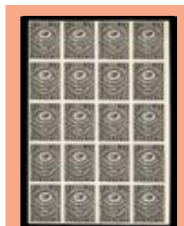
OFFER #19010 #RS242P4, BLOCK OUR PRICE $750-