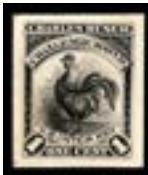
OFFER #18954 #R047P4 OUR PRICE $45-