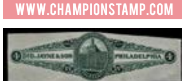
OFFER #19002 #RS149P3 OUR PRICE $65-