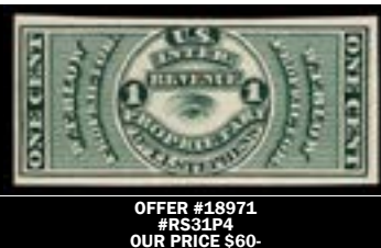
OFFER #18971 #RS31P4 OUR PRICE $60-