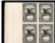
OFFER #18986 #RS96P4, BLOCK OUR PRICE $125-