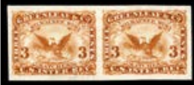
OFFER #18959 #R0101TC3, TRIAL COLOR OUR PRICE $90-