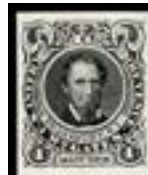
OFFER #18956 #R087P3, PAIR OUR PRICE $65-