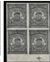
OFFER #18973 #RS33P3, BLOCK OUR PRICE $110-