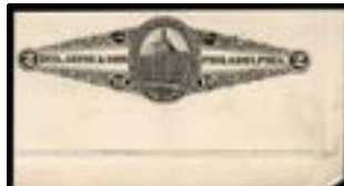
OFFER #19000 #RS145P4 OUR PRICE $65-