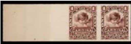
OFFER #18955 #R058P3, PAIR OUR PRICE $90-