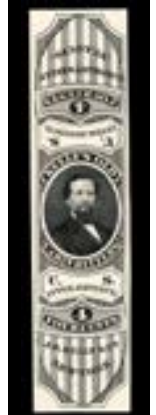
OFFER #18998 #RS153P4 OUR PRICE $95-