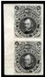
OFFER #18962 #R0155P3, PAIR OUR PRICE $90-