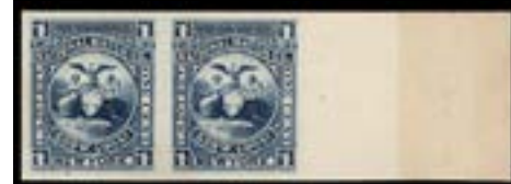
OFFER #18995 #R0134P4, PAIR OUR PRICE $90-