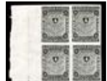
OFFER #18988 #RS108P3, BLOCK OUR PRICE $100-