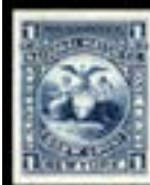
OFFER #18994 #R0134P3 OUR PRICE $45-