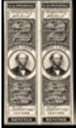
OFFER #18966 #RS19P4, PAIR OUR PRICE $155-