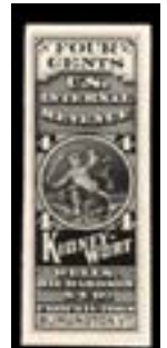
OFFER #19011 #RS263P4 OUR PRICE $45-