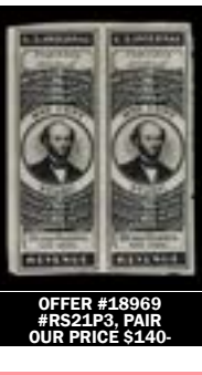
OFFER #18969 #RS21P3, PAIR OUR PRICE $140-