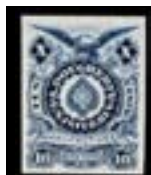
OFFER #19016 #RU6P3 OUR PRICE $80-