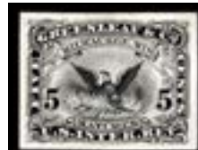
OFFER #18987 #R0102TC:1ae, TRIAL COLOR OUR PRICE $125-