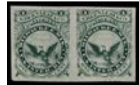
OFFER #18957 #R0100P3, PAIR OUR PRICE $90-