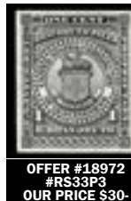
OFFER #18972 #RS33P3 OUR PRICE $30-