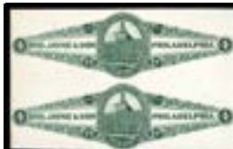
OFFER #19001 #RS146P4, PAIR OUR PRICE $125-