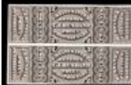
OFFER #18996 #RS139P4, PAIR OUR PRICE $110-