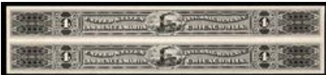
OFFER #19003 #RS161P4 OUR PRICE $95-, $190- PAIR