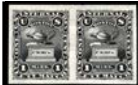
OFFER #18963 #R0180P3, PAIR OUR PRICE $100-