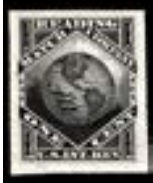
OFFER #18961 #R0153P3 OUR PRICE $45-