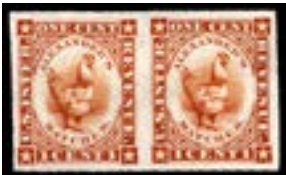
OFFER #18953 #R02P3, PAIR OUR PRICE $110-