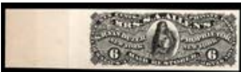
OFFER #19012 #RS250P4 OUR PRICE $65-