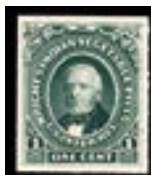
OFFER #19014 #RS274P4 OUR PRICE $30-