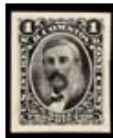
OFFER #18980 #RS60P4 OUR PRICE $40-