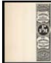
OFFER #18990 #RS122P4 OUR PRICE $75-