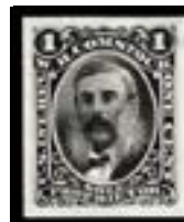
OFFER #18978 #RS60P3 OUR PRICE $45-