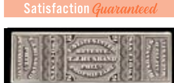
OFFER #18997 #RS139P4 OUR PRICE $60-