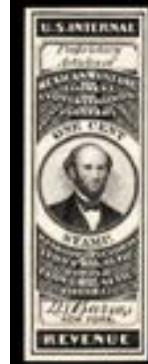
OFFER #18964 #RS18P4 OUR PRICE $75-