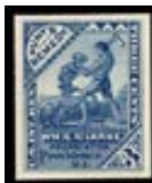
OFFER #18977 #RS50P4 OUR PRICE $85-