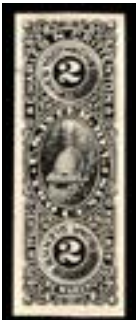
OFFER #18981 #RS64P4 OUR PRICE $85-