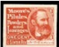
OFFER #19005 #RS183P4 OUR PRICE $55-