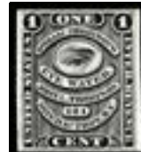
OFFER #19009 #RS242P3 OUR PRICE $35-