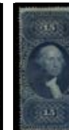
OFFER #19952 #R97c, F-VF OUR PRICE $210-