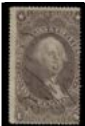
OFFER #19933 #R84c OUR PRICE $18-