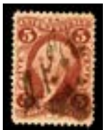
OFFER #19904 #R29c, VF OUR PRICE $21-