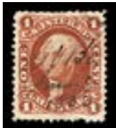
OFFER #19898 #R2c, VF OUR PRICE $160-