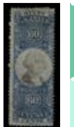
OFFER #19962 #R116, CUT CANCEL OUR PRICE $35-