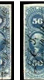
OFFER #19916 #R59a OUR PRICE $14-