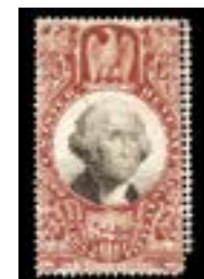
OFFER #19973 #R146, XTRA PERFS OUR PRICE $80-