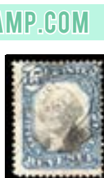
OFFER #19960 #R110 OUR PRICE $40-