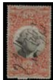
OFFER #19972 #R145 OUR PRICE $27.50