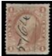
OFFER #19896 #R1b OUR PRICE $30-