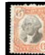
OFFER #19968 #R138 OUR PRICE $16-