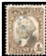
OFFER #19967 #R136 OUR PRICE $20-