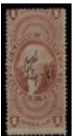
OFFER #19927 #R74c OUR PRICE $250-