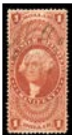
OFFER #19926 #R72c OUR PRICE $35-