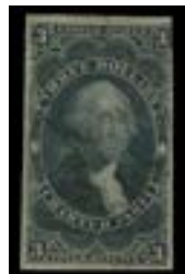
OFFER #19935 #R85a, F-VF OUR PRICE $120-