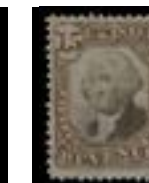
OFFER #19969 #R139 OUR PRICE $18-