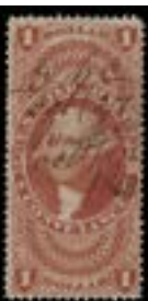
OFFER #19920 #R65c OUR PRICE $15-