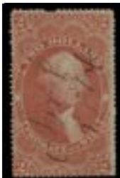
OFFER #19932 #R83c OUR PRICE $25-