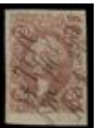
OFFER #19906 #R42a OUR PRICE $15-