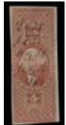
OFFER #19943 #R89a OUR PRICE $40-