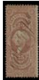
OFFER #19911 #R50c OUR PRICE $20-