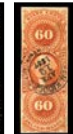
OFFER #19918 #R62c OUR PRICE $20-