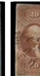
OFFER #19953 #R98a OUR PRICE $130-