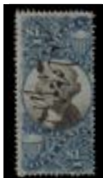
OFFER #19963 #R120 OUR PRICE $15-