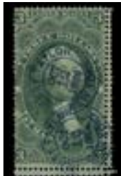
OFFER #19939 #R86c, DOUBLE PERF 2 SIDES OUR PRICE $40-