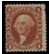
OFFER #19897 #R2c OUR PRICE $225-