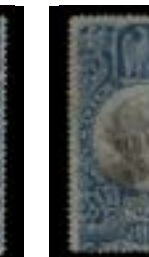
OFFER #19965 #R124 OUR PRICE $15-