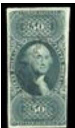
OFFER #19957 #R101a OUR PRICE $325-