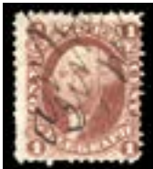
OFFER #19899 #R4c OUR PRICE $16-