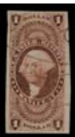
OFFER #19925 #R72a OUR PRICE $30-