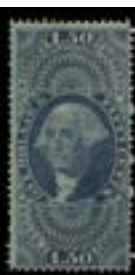
OFFER #19930 #R78c OUR PRICE $5-