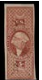
OFFER #19944 #R91a OUR PRICE $120-