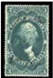
OFFER #19936 #R85c OUR PRICE $15-