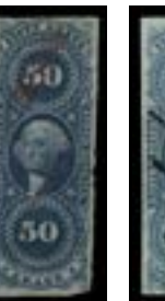
OFFER #19914 #R57a OUR PRICE $20-