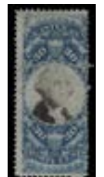
OFFER #19961 #R113 OUR PRICE $75-