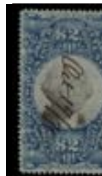
OFFER #19964 #R123 OUR PRICE $18-