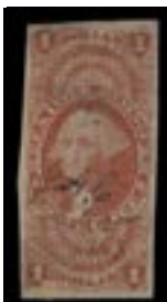
OFFER #19922 #R66a OUR PRICE $20-