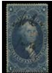
OFFER #19940 #R87c OUR PRICE $30-