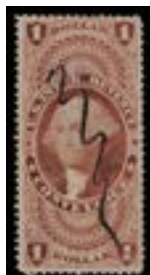
OFFER #19923 #R66c OUR PRICE $19-