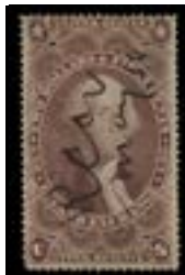
OFFER #19934 #R84c OUR PRICE $18-