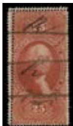
OFFER #19955 #R100c, XTRA PERFS OUR PRICE $150-