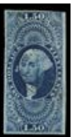
OFFER #19929 #R78a OUR PRICE $20-