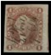
OFFER #19895 #R1a, VF OUR PRICE $75-