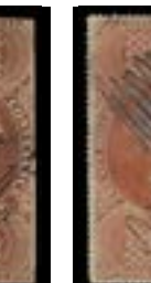
OFFER #19954 #R98c OUR PRICE $95-