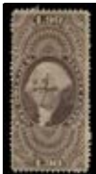
OFFER #19931 #R80c OUR PRICE $120-