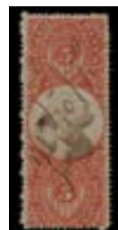
OFFER #19975 #R148 OUR PRICE $35-