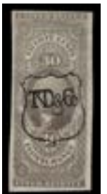
OFFER #19912 #R52a OUR PRICE $45-

INTEREST FREE INSTALLMENT TERMS AVAILABLE IF NEEDED FOR LARGER PURCHASES!