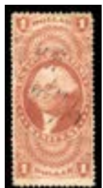
OFFER #19924 #R72c OUR PRICE $20-