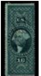
OFFER #19945 #R93c OUR PRICE $25-