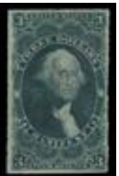
OFFER #19937 #R86a OUR PRICE $125-