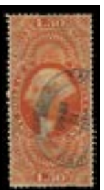
OFFER #19928 #R77c OUR PRICE $55-