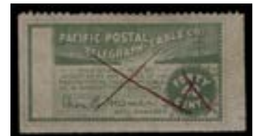
OFFER #19977 #147a, W/O NUMBER, MAGENTA CUT CANCEL OUR PRICE $50-