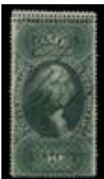
OFFER #19956 #R101c, XTRA PERFS OUR PRICE $110-