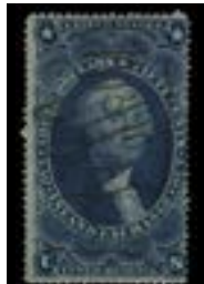
OFFER #19941 #R87c OUR PRICE $50-