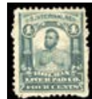
OFFER #19976 #RS130b OUR PRICE $250-