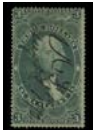
OFFER #19938 #R86c OUR PRICE $30-