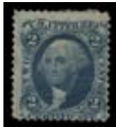
OFFER #19900 #R7c OUR PRICE $22.50