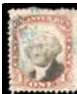
OFFER #19966 #R134, PINHOLE OUR PRICE $30-