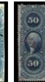
OFFER #19917 #R61a OUR PRICE $80-