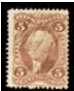
OFFER #19903 #R28c OUR PRICE $32.50