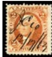
OFFER #19901 #R8c, F-VF OUR PRICE $22.50