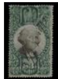
OFFER #19974 #R147 OUR PRICE $28-