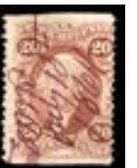
OFFER #19907 #R42b OUR PRICE $15-