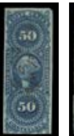
OFFER #19913 #R54a OUR PRICE $15-