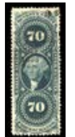
OFFER #19919 #R64a OUR PRICE $60-