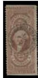
OFFER #19909 #R46b OUR PRICE $17-