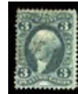
OFFER #19902 #R17c, F-VF OUR PRICE $150-