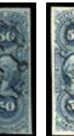
OFFER #19915 #R58a OUR PRICE $28-