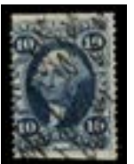
OFFER #19905 #R37b OUR PRICE $19-