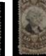
OFFER #19970 #R141 OUR PRICE $35-