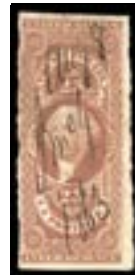
OFFER #19910 #R49a OUR PRICE $25-