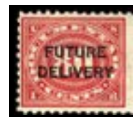
OFFER #20820 #RC23 OUR PRICE $120-