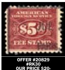
OFFER #20829 #RK30 OUR PRICE $20-