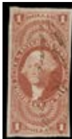
OFFER #20794 #R76a OUR PRICE $60-