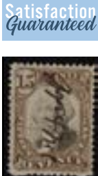
OFFER #20811 #R139 OUR PRICE $20-