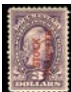
OFFER #20822 #RD14 OUR PRICE $25-