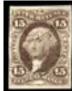
OFFER #20780 #R40a OUR PRICE $28-