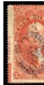
OFFER #20797 #R81, W/IMPRINT OUR PRICE $15-