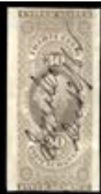
OFFER #20785 #R52a OUR PRICE $45-