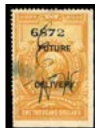
OFFER #20826 #RD24 OUR PRICE $70-