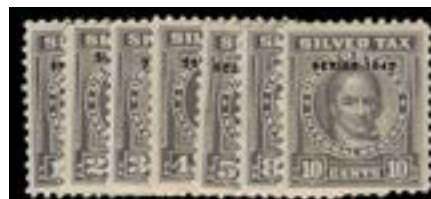
OFFER #20827 #RG83-89, SHORT SET OUR PRICE $22-