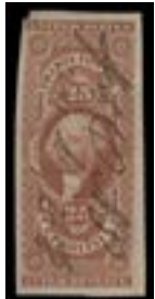
OFFER #20782 #R49a OUR PRICE $20-