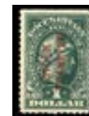
OFFER #20821 #RD11, NO GUM STAPLE HOLES OUR PRICE $35-