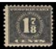
OFFER #20818 #RB37 OUR PRICE $35-