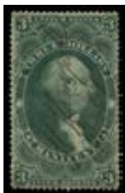
OFFER #20800 #R86 OUR PRICE $35-