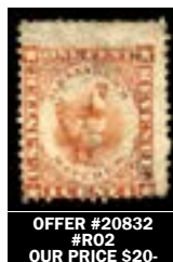
OFFER #20832 #R02 OUR PRICE $20-