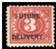
OFFER #20819 #RC2 OUR PRICE $30-