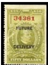
OFFER #20824 #RD20, NO GUM OUR PRICE $75-