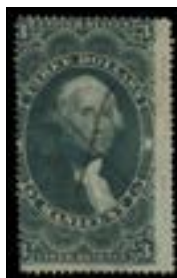
OFFER #20802 #R86c, THIN OUR PRICE $20-