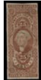
OFFER #20781 #R43a OUR PRICE $180-