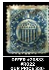
OFFER #20833 #R022 OUR PRICE $30-