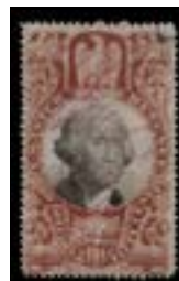
OFFER #20813 #R146 OUR PRICE $75-