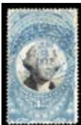
OFFER #20810 #R126 OUR PRICE $350-