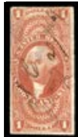
OFFER #20789 #R70a OUR PRICE $35-