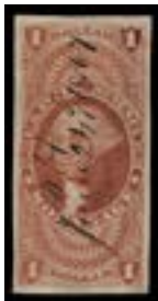
OFFER #20792 #R73a OUR PRICE $25-

INTEREST FREE INSTALLMENT TERMS AVAILABLE IF NEEDED FOR LARGER PURCHASES!