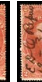
OFFER #20798 #R83 OUR PRICE $60-