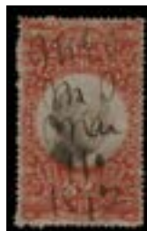
OFFER #20812 #R145 OUR PRICE $45-