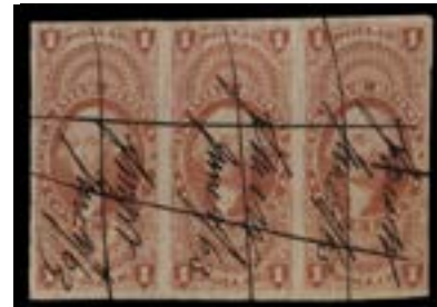
OFFER #20788 #R66a, STRIP OF 3 OUR PRICE $120-