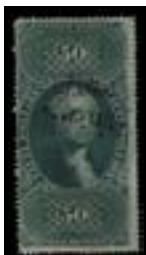
OFFER #20809 #R101c OUR PRICE $125-