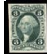
OFFER #20775 #R16 PROOF OUR PRICE $30-