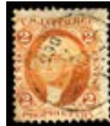
OFFER #20774 #R14 OUR PRICE $45-