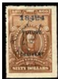
OFFER #20825 #RD21 OUR PRICE $20-