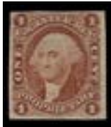
OFFER #20771 #R3a OUR PRICE $775-