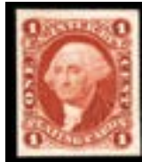
OFFER #20772 #R2P3 OUR PRICE $50-