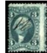
OFFER #20776 #R17 OUR PRICE $150-