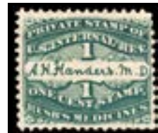
OFFER #20836 #RS87a OUR PRICE $30-