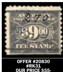
OFFER #20830 #RK31 OUR PRICE $55-