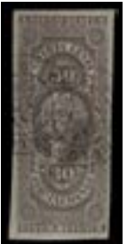
OFFER #20784 #R51a OUR PRICE $150-