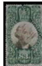
OFFER #20814 #R147, PERF CUT OUR PRICE $50-