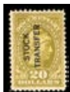
OFFER #20823 #RD18 OUR PRICE $95-