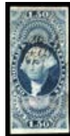
OFFER #20795 #R78a OUR PRICE $22-