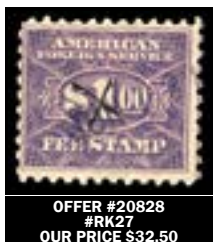
OFFER #20828 #RK27 OUR PRICE $32.50