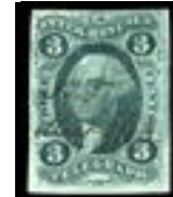
OFFER #20777 #R19a OUR PRICE $80-