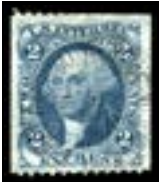
OFFER #20778 #R35b OUR PRICE $20-