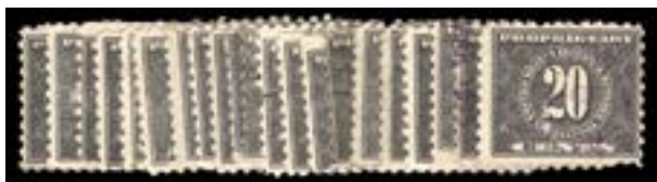
OFFER #20817 #RB44-64, MIXED CONDITION OUR PRICE $75-