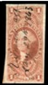
OFFER #20790 #R71a OUR PRICE $195-