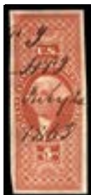
OFFER #20803 #R89a OUR PRICE $35-