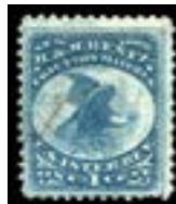
OFFER #20834 #R028 OUR PRICE $18-