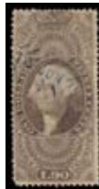
OFFER #20796 #R80c, THIN AT TOP OUR PRICE $60-