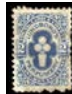
OFFER #20838 #RT29b OUR PRICE $30-