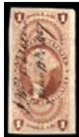
OFFER #20793 #R75a OUR PRICE $60-