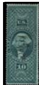
OFFER #20806 #R94c OUR PRICE $50-