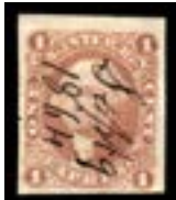
OFFER #20770 #R1a OUR PRICE $65-