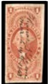
OFFER #20787 #R66a OUR PRICE $25-