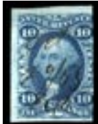
OFFER #20779 #R36a OUR PRICE $295-