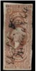
OFFER #20783 #R50a OUR PRICE $35-