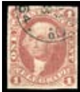
OFFER #20773 #R4a OUR PRICE $625-