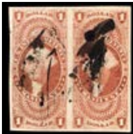
OFFER #20791 #R72a, PAIR OUR PRICE $75-

WWW.CHAMPIONSTAMP.COM CALL (212) 489 - 8130