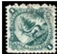
OFFER #20835 #R057 OUR PRICE $35-