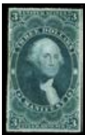
OFFER #20801 #R86a OUR PRICE $150-