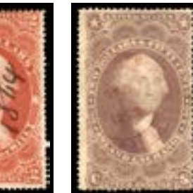
OFFER #20799 #R84 OUR PRICE $15-