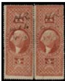
OFFER #20804 #R91c, PAIR OUR PRICE $50-