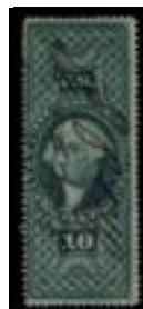
OFFER #20805 #R93c OUR PRICE $25-