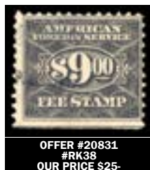
OFFER #20831 #RK38 OUR PRICE $25-