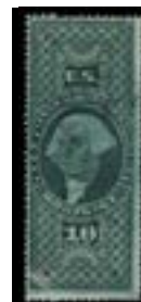
OFFER #20807 #R95c OUR PRICE $25-