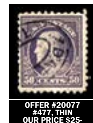
OFFER #20077 #477, THIN OUR PRICE $25-