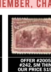
OFFER #20057 #242, SM THINS OUR PRICE $195-