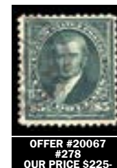
OFFER #20067 #278 OUR PRICE $225-