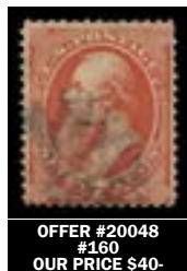
OFFER #20048 #160 OUR PRICE $40-