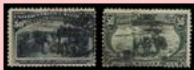
OFFER #20064 #240+291 50/50 SM FAULTS PAIR, TRANS/COLUMBIAN OUR PRICE $75-