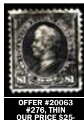
OFFER #20063 #276, THIN OUR PRICE $25-