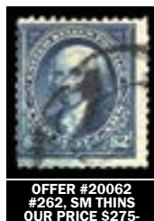
OFFER #20062 #262, SM THINS OUR PRICE $275-