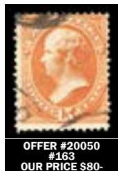
OFFER #20050 #163 OUR PRICE $80-