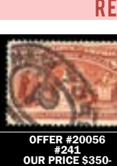
OFFER #20056 #241 OUR PRICE $350-