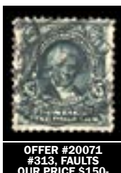
OFFER #20071 #313, FAULTS OUR PRICE $150-