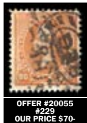
OFFER #20055 #229 OUR PRICE $70-