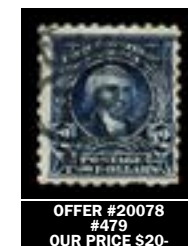
OFFER #20078 #479 OUR PRICE $20-