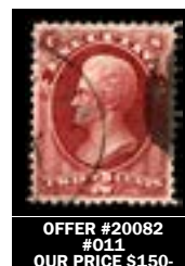
OFFER #20082 #011 OUR PRICE $150-