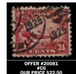
OFFER #20081 #C6 OUR PRICE $22.50