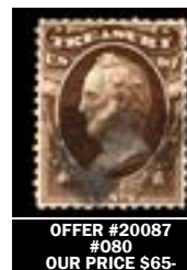
OFFER #20087 #080 OUR PRICE $65-