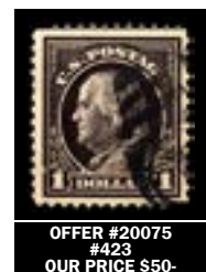
OFFER #20075 #423 OUR PRICE $50-