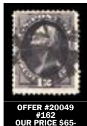
OFFER #20049 #162 OUR PRICE $65-