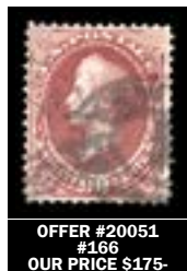
OFFER #20051 #166 OUR PRICE $175-