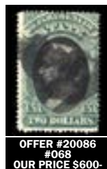
OFFER #20086 #068 OUR PRICE $600-