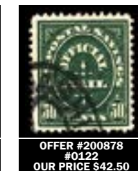
OFFER #200878 #0122 OUR PRICE $42.50