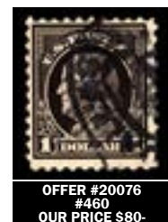
OFFER #20076 #460 OUR PRICE $80-