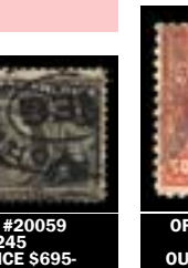
OFFER #20060 #260 OUR PRICE $60-