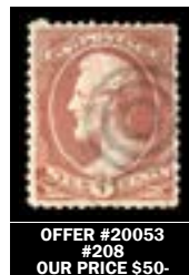
OFFER #20053 #208 OUR PRICE $50-