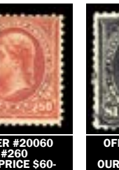
OFFER #20061 #261A OUR PRICE $350-