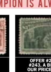
OFFER #20058 #243, A BEAUTY OUR PRICE $595-