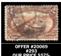
OFFER #20069 #293 OUR PRICE $575-