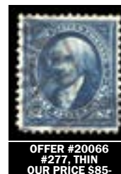
OFFER #20066 #277, THIN OUR PRICE $85-