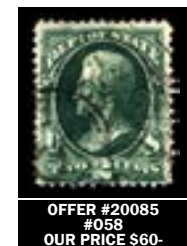
OFFER #20085 #058 OUR PRICE $60-