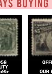
OFFER #20059 #245 OUR PRICE $695-