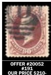
OFFER #20052 #191 OUR PRICE $210-