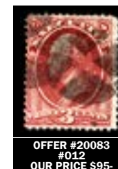
OFFER #20083 #012 OUR PRICE $95-