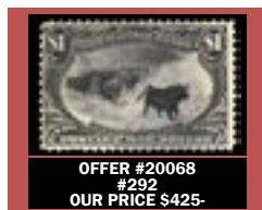
OFFER #20068 #292 OUR PRICE $425-