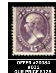
OFFER #20084 #031 OUR PRICE $125-