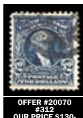
OFFER #20070 #312 OUR PRICE $130-