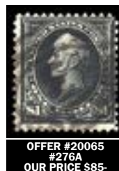
OFFER #20065 #276A OUR PRICE $85-