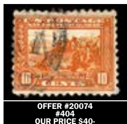
OFFER #20074 #404 OUR PRICE $40-

INSTALLMENT TERMS AVAILABLE IF NEEDED FOR LARGER PURCHASES!