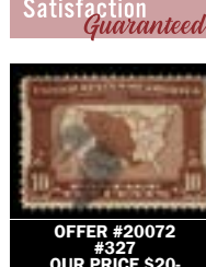
OFFER #20072 #327 OUR PRICE $20-