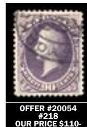
OFFER #20054 #218 OUR PRICE $110-