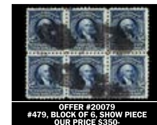
OFFER #20079 #479, BLOCK OF 6, SHOW PIECE OUR PRICE $350-