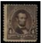
OFFER #22012 #222, NO GUM OUR PRICE $25-