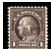
OFFER #22086 #518, LH, VF OUR PRICE $29-