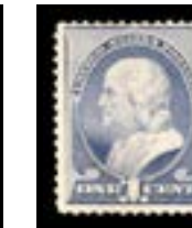
OFFER #22009 #212, NO GUM OUR PRICE $15-