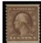
OFFER #22074 #457, LH OUR PRICE $20-