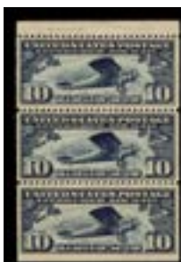
OFFER #22098 #C10a, NH, XF OUR PRICE $75-