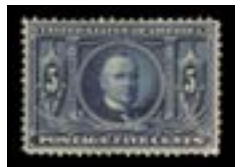
OFFER #22057 #326, LH OUR PRICE $50-