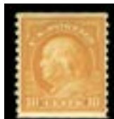
OFFER #22079 #497, NH, VF OUR PRICE $28-