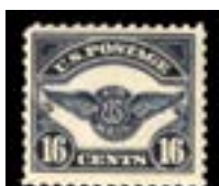
OFFER #22096 #C5, NH, F-VF OUR PRICE $75-

CHAMPION IS ALWAYS BUYING SEND YOUR WANTLIST TODAY!