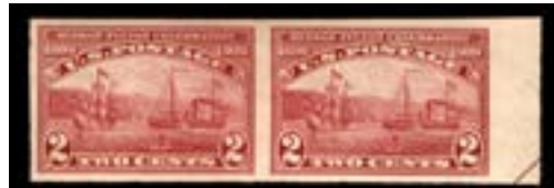
OFFER #22068 #373, NH, PAIR OUR PRICE $60-