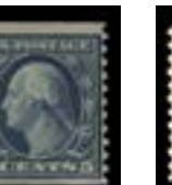
OFFER #22076 #460, LH, VF OUR PRICE $525-