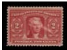
OFFER #22055 #324, NH OUR PRICE $45-