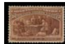
OFFER #22022 #239, LH OUR PRICE $150-