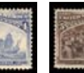
OFFER #22017 #234, LH OUR PRICE $50-

CALL OR EMAIL TO RESERVE SEND YOUR WANTLIST TODAY!