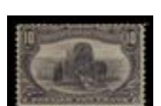
OFFER #22038 #290, LH OUR PRICE $125-