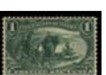
OFFER #22033 #285, LH, VF-XF OUR PRICE $25-