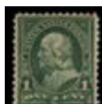
OFFER #22030 #279, NH, F-VF OUR PRICE $25-