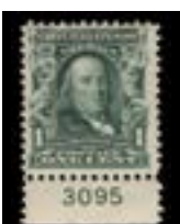
OFFER #22045 #300, NH, PL, # OUR PRICE $25-