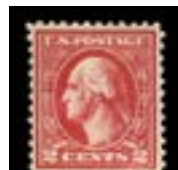
OFFER #22087 #528, NH, F-VF OUR PRICE $22.50