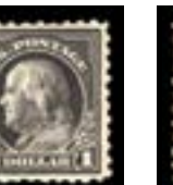
OFFER #22077 #474, LH OUR PRICE $45-