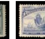
OFFER #22016 #233, LH OUR PRICE $30-