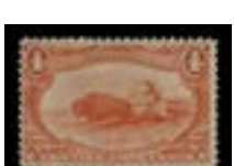
OFFER #22035 #287, LH OUR PRICE $60-