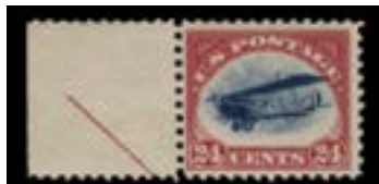
OFFER #22094 #C3, NH, F-VF OUR PRICE $80-