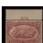
OFFER #22034 #286, LH, PL, # OUR PRICE $30-