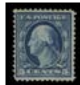
OFFER #22062 #335, LH OUR PRICE $35-