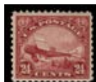
OFFER #22097 #C6, NH, F-VF OUR PRICE $80-