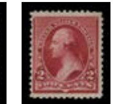
OFFER #22011 #220, NH OUR PRICE $20-