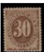
OFFER #22101 #J6, REGUM OUR PRICE $350-