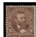
OFFER #22026 #255, LH OUR PRICE $70-