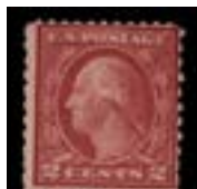
OFFER #22089 #540, NH OUR PRICE $17.50