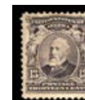
OFFER #22050 #308, LH, XF OUR PRICE $35-