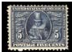
OFFER #22059 #330, LH, F-VF OUR PRICE $70-