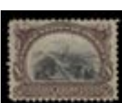
OFFER #22043 #298, NH, XF OUR PRICE $150-