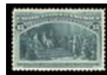
OFFER #22021 #238, FRESH COLOR REGUM, WELL CENTERED OUR PRICE $140-