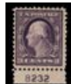
OFFER #22080 #501, NH, PL # OUR PRICE $20-