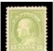
OFFER #22084 #513, NH OUR PRICE $15-

VISIT OUR WEBSITE FOR MORE WWW.CHAMPIONSTAMP.COM