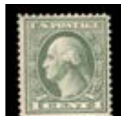
OFFER #22088 #536, NH OUR PRICE $20-