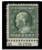
OFFER #22060 #331, NH STAR PL # OUR PRICE $25-