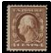
OFFER #22061 #334, NH OUR PRICE $40-