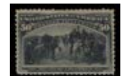
OFFER #22023 #240, LH OUR PRICE $265-