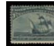
OFFER #22015 #232, NH OUR PRICE $25-