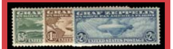
OFFER #22099 #C13-15, NH, VF, COMPLETE SET OUR PRICE $1,250-