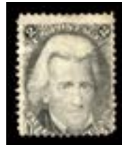
OFFER #22002 #73, NO GUM OUR PRICE $60-