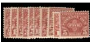
OFFER #22102 #J69-78, F-VF, COMPLETE SET J74, 76, 78 LH, BALANCE NH OUR PRICE $575-