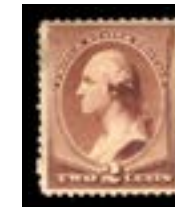
OFFER #22008 #210, NH, STAIN UL OUR PRICE $45-