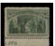
OFFER #22024 #243, LH OUR PRICE $875-