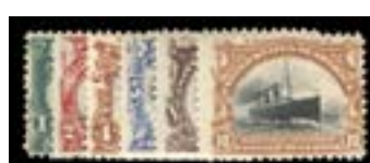
OFFER #22041 #294-9, H OUR PRICE $195-