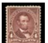
OFFER #22031 #280, LH, VF OUR PRICE $30-