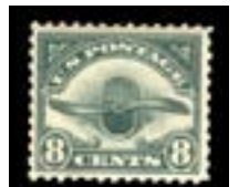
OFFER #22095 #C4, NH, F-VF OUR PRICE $22-

CHAMPION IS ALWAYS BUYING SEND YOUR WANTLIST TODAY!