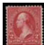
OFFER #22028 #266, NH OUR PRICE $80-