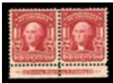
OFFER #22053 #319, NH, W/INSCRIPTION OUR PRICE $30-