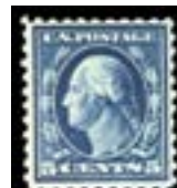
OFFER #22073 #428, LH, XF OUR PRICE $30-