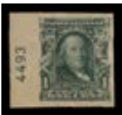
OFFER #22052 #314, LH, PL # OUR PRICE $15-