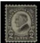
OFFER #22091 #612, NH, XF OUR PRICE $20-