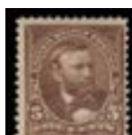
OFFER #22029 #270, LH OUR PRICE $27-