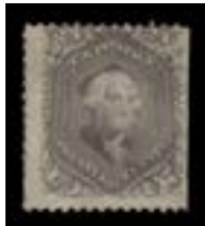
OFFER #22000 #70, NO GUM OUR PRICE $395-