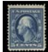
OFFER #22069 #378, LH, XF OUR PRICE $30-