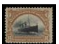
OFFER #22044 #299, MH OUR PRICE $180-