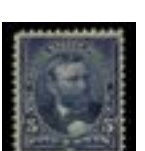
OFFER #22032 #281, LH OUR PRICE $35-