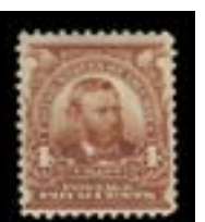
OFFER #22047 #303, LH OUR PRICE $45-