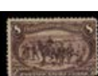
OFFER #22037 #289, LH OUR PRICE $85-