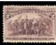
OFFER #22014 #231, NH, F-VF OUR PRICE $25-