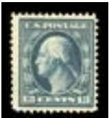
OFFER #22065 #339, LH OUR PRICE $22-