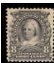
OFFER #22049 #306, NH OUR PRICE $80-