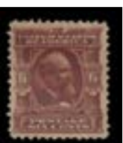
OFFER #22048 #305, LH OUR PRICE $50-