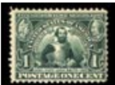
OFFER #22058 #328, NH OUR PRICE $25-