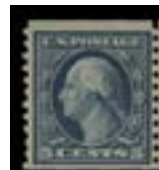
OFFER #22075 #458, LH, PAIR OUR PRICE $40-