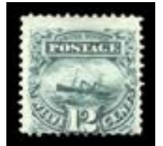
OFFER #22004 #117, NO GUM OUR PRICE $395-