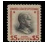
OFFER #22092 #834, NH OUR PRICE $30-