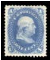
OFFER #21999 #63, LH OUR PRICE $175-