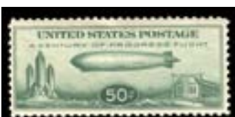
OFFER #22100 #C18, NH, VF OUR PRICE $50-