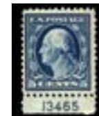
OFFER #22083 #504, NH F-VF, PL # OUR PRICE $47-

EMAIL US YOUR WANTLIST FOR AN IMMEDIATE RESPONSE Satisfaction Guaranteed