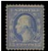
OFFER #22066 #340, LH, VF OUR PRICE $55-