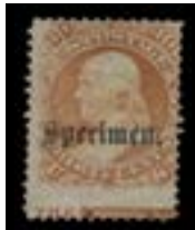
OFFER #22001 #71sb, SPECIMEN OUR PRICE $110-