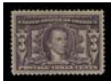
OFFER #22056 #325, LH OUR PRICE $50-