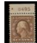
OFFER #22082 #503, NH, PL # OUR PRICE $20-