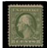
OFFER #22063 #337, LH OUR PRICE $30-