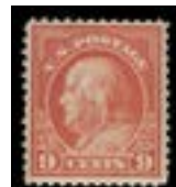
OFFER #22072 #415, LH, XF OUR PRICE $50-