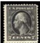
OFFER #22071 #407, NH OUR PRICE $80-