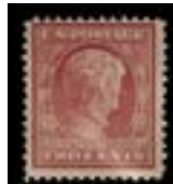
OFFER #22067 #369, LH OUR PRICE $85-