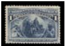
OFFER #22013 #230, NH, VF OUR PRICE $30-