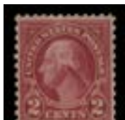
OFFER #22090 #579, NH, VF OUR PRICE $120-