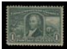
OFFER #22054 #323, NH OUR PRICE $43-