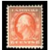
OFFER #22070 #379, NH OUR PRICE $45-