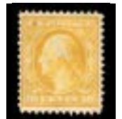
OFFER #22064 #338, LH OUR PRICE $45-