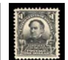
OFFER #22051 #311, LH, XF OUR PRICE $425-