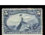
OFFER #22036 #288, LH OUR PRICE $65-