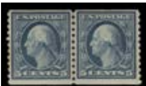
OFFER #22078 #496, NH, LINE PAIR OUR PRICE $45-