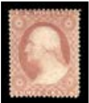
OFFER #21998 #26, NH OUR PRICE $80-