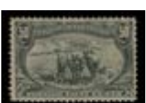
OFFER #22039 #291, LH, VERY SMALL THIN OUR PRICE $175-