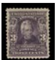
OFFER #22046 #302, LH OUR PRICE $50-