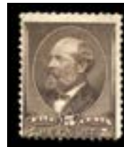
OFFER #22006 #205, DIST GUM OUR PRICE $75-