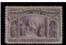
OFFER #22018 #235, NH, XF OUR PRICE $150-

CALL OR EMAIL TO RESERVE SEND YOUR WANTLIST TODAY!