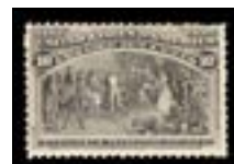
OFFER #22020 #237, LH OUR PRICE $65-