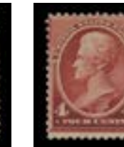
OFFER #22010 #215, LH OUR PRICE $95-