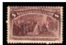
OFFER #22019 #236, NH OUR PRICE $50-