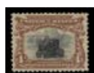
OFFER #22042 #296, NH, XF OUR PRICE $120-