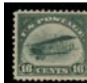
OFFER #22093 #C2, NH, VF OUR PRICE $75-