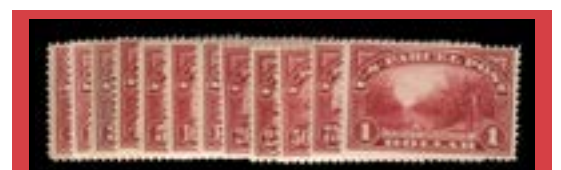
OFFER #22103 #Q1-12, NH OUR PRICE $1,595-