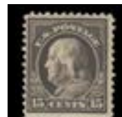
OFFER #22085 #514, NH OUR PRICE $60-