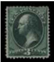
OFFER #22005 #158, LH, SHORT PERF TR OUR PRICE $45-