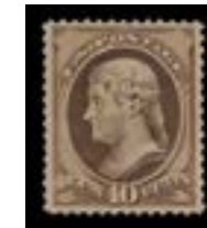
OFFER #22007 #209, NO GUM OUR PRICE $65-