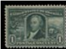
OFFER #26843 #323, FRESH, F-VF, NH OUR PRICE $30-