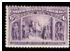
OFFER #26798 #235, F-VF, NH OUR PRICE $95-