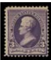
OFFER #26787 #221, NH OUR PRICE $75-