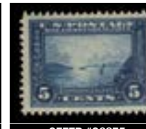
OFFER #26875 #399, F-VF, NH OUR PRICE $85-