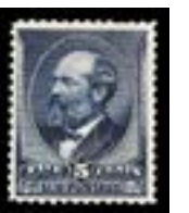
OFFER #26782 #216, F-VF, NH OUR PRICE $475-