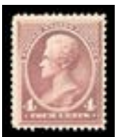
OFFER #26781 #215, NH OUR PRICE $295-