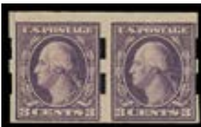
OFFER #26859 #345, PERF 3MM, F-VF, NH OUR PRICE $195-

INSTALLMENT TERMS AVAILABLE IF NEEDED FOR LARGER PURCHASES!