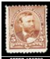
OFFER #26788 #223, H OUR PRICE $12-