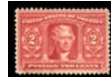
OFFER #26844 #324, F-VF, LH OUR PRICE $25-