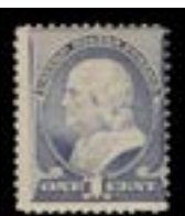
OFFER #26778 #212, LH OUR PRICE $20-