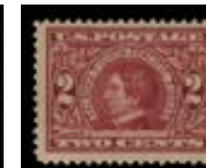
OFFER #26865 #370, F-VF, NH OUR PRICE $14-