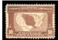
OFFER #26847 #327, F-VF, NH, DIST. LIGHT GUM OUR PRICE $125-