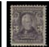
OFFER #26837 #302, F-VF, LH OUR PRICE $30-