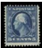
OFFER #26853 #335, LH OUR PRICE $15-