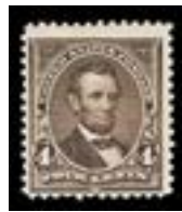
OFFER #26814 #269, LH OUR PRICE $50-