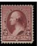
OFFER #26785 #219, F-VF, LH OUR PRICE $65-