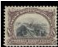
OFFER #26835 #298, LH OUR PRICE $45-