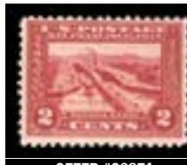
OFFER #26874 #398, F-VF, NH OUR PRICE $40-