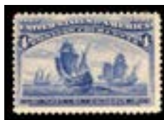
OFFER #26796 #233, LH OUR PRICE $20-