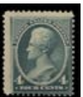
OFFER #26777 #211, NH OUR PRICE $175-