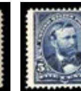
OFFER #26822 #281, NH OUR PRICE $25-