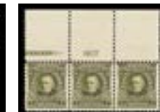
OFFER #26841 #309, STRIP OF 3, F-VF, LH PARTIAL IMPRINT PL # OUR PRICE $395-