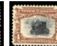
OFFER #26833 #296, F-VF, H OUR PRICE $35-