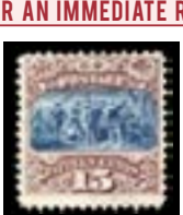
OFFER #26768 #118, F-VF, NO GUM W/PF CERT OUR PRICE $995-