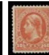
OFFER #26820 #275, LH OUR PRICE $160-