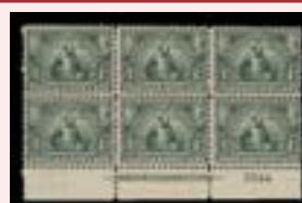
OFFER #26849 #328, PL.BL, NH OUR PRICE $450-

IF YOU COLLECT PLATE BLOCKS, VISIT OUR WEBSITE TO VIEW HUNDREDS MORE. YOU CAN ALSO SEND US YOUR WANTLIST AND WE WILL LOOK FOR YOU