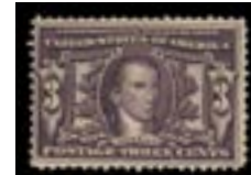
OFFER #26845 #325, LH OUR PRICE $50-