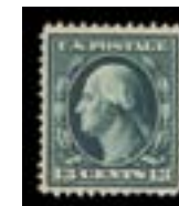
OFFER #26856 #339, LH OUR PRICE $35-