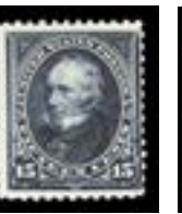
OFFER #26810 #259, LH OUR PRICE $195-