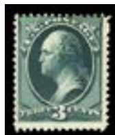
OFFER #26770 #158, NH OUR PRICE $125-