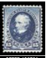
OFFER #26791 #227, LH OUR PRICE $150-