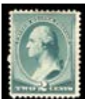
OFFER #26779 #213, F-VF, LH OUR PRICE $40-