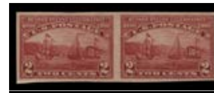
OFFER #26867 #373, PAIR, F-VF, LH OUR PRICE $40-