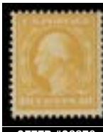
OFFER #26870 #381, NH OUR PRICE $110-