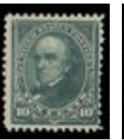
OFFER #26809 #258, LH OUR PRICE $275-