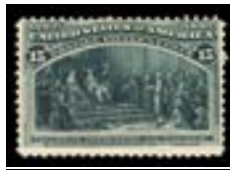
OFFER #26802 #238, F-VF, NH OUR PRICE $295-