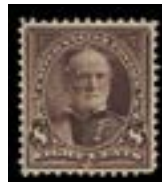
OFFER #26817 #272, F-VF, H OUR PRICE $50-