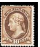
OFFER #26775 #209, H OUR PRICE $80-