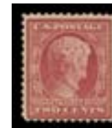
OFFER #26864 #369, LH OUR PRICE $105-