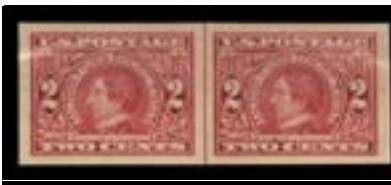
OFFER #26866 #371, PAIR, LH OUR PRICE $20-