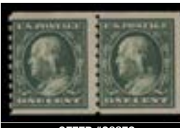
OFFER #26872 #392, PAIR, H OUR PRICE $15-