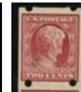
OFFER #26863 #368, PAIR, LH OUR PRICE $65-