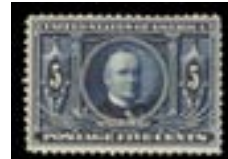
OFFER #26846 #326, LH OUR PRICE $50-