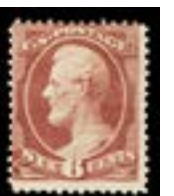
OFFER #26774 #208a, H OUR PRICE $200-