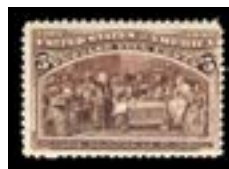
OFFER #26797 #234, NH OUR PRICE $95-