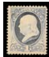
OFFER #26771 #206, F-VF, H OUR PRICE $45-