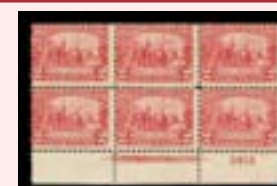
OFFER #26850 #329, PL.BL, LH OUR PRICE $150-