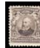
OFFER #26840 #308, F-VF, LH OUR PRICE $35-