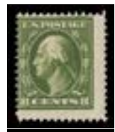
OFFER #26869 #380, NH OUR PRICE $65-