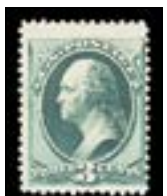
OFFER #26772 #184, NH OUR PRICE $125-