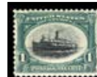
OFFER #26831 #294, F-VF, NH OUR PRICE $25-