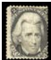
OFFER #26761 #73, LH OUR PRICE $85-