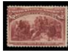
OFFER #26806 #242, LH, POSSIBLE REGUM OUR PRICE $375-