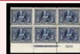
OFFER #26851 #330, PL.BL, SEVERAL HINGE MARKS, LH OUR PRICE $750-