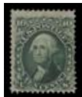
OFFER #26760 #68, NO GUM FRESH STAMP OUR PRICE $135-