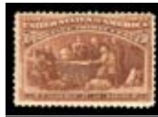
OFFER #26803 #239, F-VF, LH OUR PRICE $145-