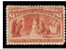
OFFER #26805 #241, LH, SWEATED GUM OUR PRICE $675-