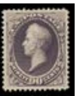
OFFER #26784 #218, NO GUM OUR PRICE $550-