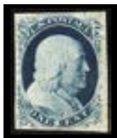
OFFER #26756 #9, H, 4 MARGINS RECUT AT TOP + B OUR PRICE $550-