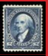
OFFER #26812 #262, LH, W/PF CERT REPERF AT RIGHT OUR PRICE $1,750-