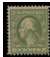
OFFER #26855 #337, NH OUR PRICE $35-