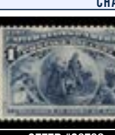
OFFER #26793 #230, VF, NH OUR PRICE $27.50