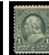
OFFER #26821 #279, NH OUR PRICE $18-