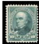
OFFER #26818 #273, F-VF, LH OUR PRICE $85-