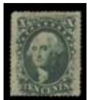
OFFER #26758 #35, NH OUR PRICE $250-