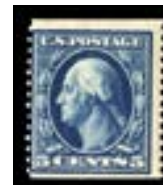
OFFER #26861 #355, VF, LH OUR PRICE $120-