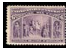
OFFER #26799 #235a, NH OUR PRICE $55-