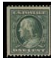
OFFER #26860 #348, F-VF, LH OUR PRICE $20-