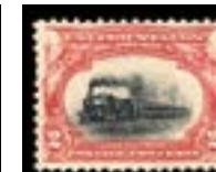
OFFER #26832 #295, F-VF, NH OUR PRICE $35-