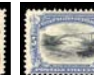
OFFER #26834 #297, FRESH, NH OUR PRICE $75-