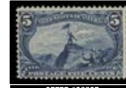
OFFER #26827 #288, F-VF, NH OUR PRICE $120-