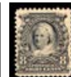
OFFER #26839 #306, F-VF, NH OUR PRICE $75-