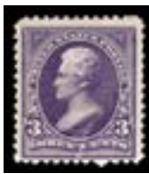
OFFER #26813 #268, F-VF, LH OUR PRICE $35-