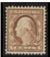
OFFER #26852 #334, F-VF, LH OUR PRICE $45-