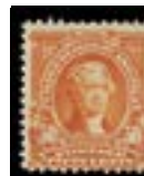
OFFER #26842 #310, LH OUR PRICE $395-