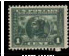
OFFER #26873 #397, F-VF, NH OUR PRICE $45-