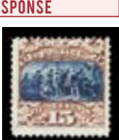
OFFER #26769 #119, H OUR PRICE $795-