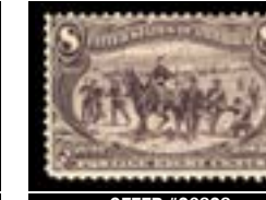
OFFER #26828 #289, F-VF, LH OUR PRICE $85-