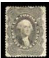
OFFER #26759 #37a, H OUR PRICE $595-