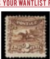
OFFER #26767 #113, H, FRESH STAMP OUR PRICE $275-