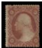
OFFER #26757 #26, LH OUR PRICE $40-