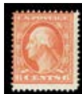
OFFER #26854 #336, LH OUR PRICE $40-