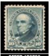
OFFER #26790 #226, F-VF, H OUR PRICE $110-