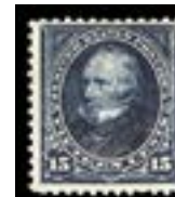
OFFER #26819 #274, F-VF, LH OUR PRICE $110-