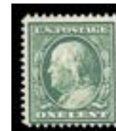
OFFER #26862 #357, LH OUR PRICE $60-