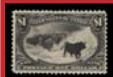
OFFER #26830 #292, LH OUR PRICE $1,100-