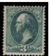
OFFER #26773 #207, F-VF, NH, FRESH OUR PRICE $100-