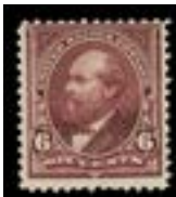
OFFER #26816 #271, LH OUR PRICE $95-