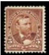
OFFER #26815 #270, F-VF, H OUR PRICE $20-