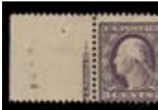
OFFER #26848 #333, PART IMPRINT, NH OUR PRICE $20-

IF YOU COLLECT PLATE BLOCKS, VISIT OUR WEBSITE TO VIEW HUNDREDS MORE. YOU CAN ALSO SEND US YOUR WANTLIST AND WE WILL LOOK FOR YOU