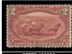
OFFER #26826 #286, FRESH, NH OUR PRICE $55-