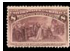
OFFER #26800 #236, F-VF, LH, FRESH COLOR OUR PRICE $20-