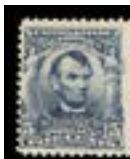
OFFER #26838 #304, NH OUR PRICE $75-