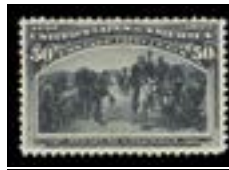
OFFER #26804 #240, F-VF, LH OUR PRICE $375-