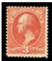
OFFER #26780 #214, LH OUR PRICE $30-