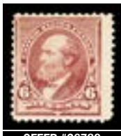
OFFER #26789 #224, LH OUR PRICE $13-