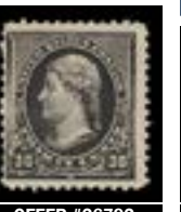
OFFER #26792 #228, H OUR PRICE $160-