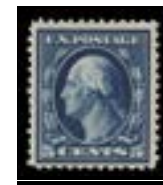
OFFER #26868 #378, F-VF, VLH OUR PRICE $22.50