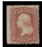
OFFER #26765 #94, LH, FRESH STRAIGHT EDGE O.G. OUR PRICE $210-