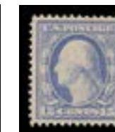
OFFER #26857 #340, F-VF, LH OUR PRICE $45-