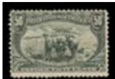
OFFER #26829 #291, THIN, REGUM, REPAIRED OUR PRICE $135-