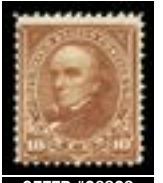
OFFER #26823 #283a, F-VF, NH OUR PRICE $395-