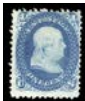
OFFER #26764 #86, NO GUM OUR PRICE $375-

EMAIL US YOUR WANTLIST FOR AN IMMEDIATE RESPONSE