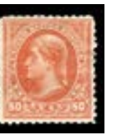
OFFER #26811 #260, F-VF, H OUR PRICE $125-