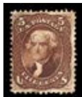
OFFER #26762 #75, NO GUM FEW TONED SPOTS OUR PRICE $550-