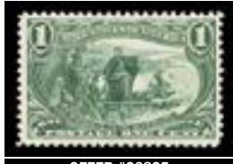
OFFER #26825 #285, F-VF, NH OUR PRICE $50-