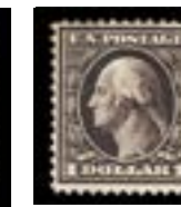
OFFER #26858 #342, F-VF, H DISTURBED GUM OUR PRICE $150-

INSTALLMENT TERMS AVAILABLE IF NEEDED FOR LARGER PURCHASES!