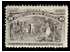
OFFER #26801 #237, LH OUR PRICE $80-