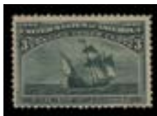
OFFER #26795 #232, NH OUR PRICE $65-