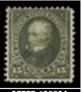
OFFER #26824 #284, F-VF, H OUR PRICE $105-