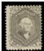
OFFER #26763 #78, NO GUM OUR PRICE $350-

EMAIL US YOUR WANTLIST FOR AN IMMEDIATE RESPONSE