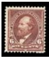
OFFER #26807 #256, LH OUR PRICE $125-