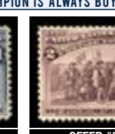
OFFER #26794 #231, XF, NH OUR PRICE $20-