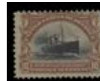
OFFER #26836 #299, LH OUR PRICE $75-