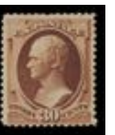
OFFER #26783 #217, LH OUR PRICE $180-