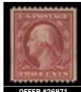
OFFER #26871 #386, F-VF, LH, PASTE UP SINGLE OUR PRICE $75-