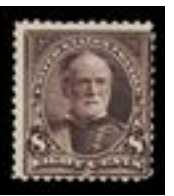
OFFER #26808 #257, LH OUR PRICE $60-