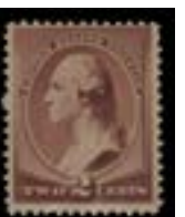
OFFER #26776 #210, F-VF, NH OUR PRICE $62.50