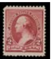
OFFER #26786 #220, F-VF, VLH OUR PRICE $30-